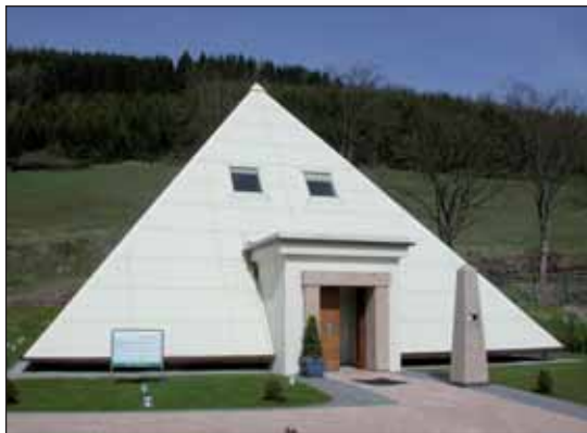
Picture 3. Every windows features automated sun protection, is operable, includes window contact switches and is fully integrated into the network