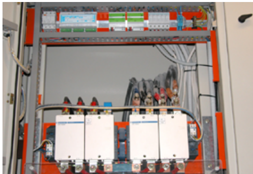
Energy distribution with supervision and measuring unit via KNX