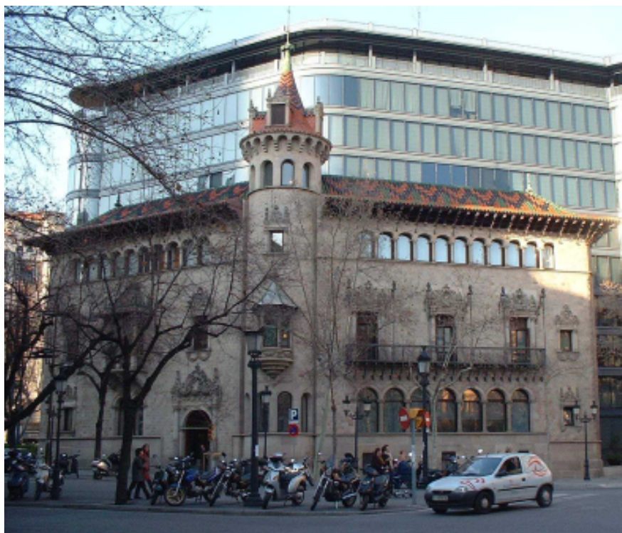
View of the inner courtyard of the banking centre

The provincial council of Barcelona was constituted in 1836. For many periods in the history of Catalonia, The Provincial Council of Barcelona has been one of the main political-administrative bodies in the country and the most important platform for the political interests of the different social groups in Catalonia.