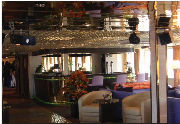
Picture 3. The unique mix of sound and light in the ballroom make for a pleasurable dancing experience.