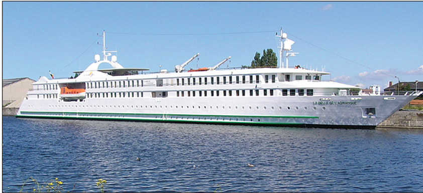
Picture 1. The MS Belle de l'Adriatique cruises safely with the right light atmosphere through the Mediterranean Sea.

The MS Belle de l'Adriatique cruises along the Croatian coast, crosses the Mediterranean Sea and goes as far the Canary Islands. The construction of the ship was started in France, and it was then transferred across the Rhine River to Brussels where the upper decks and the interior were finished.