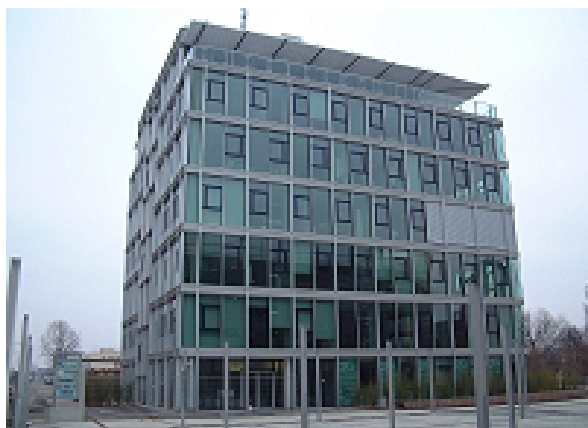
The administration building with glass facade

Bessenveldstraat 5 B - 1831 Brussels-Diegem www.konnex.org